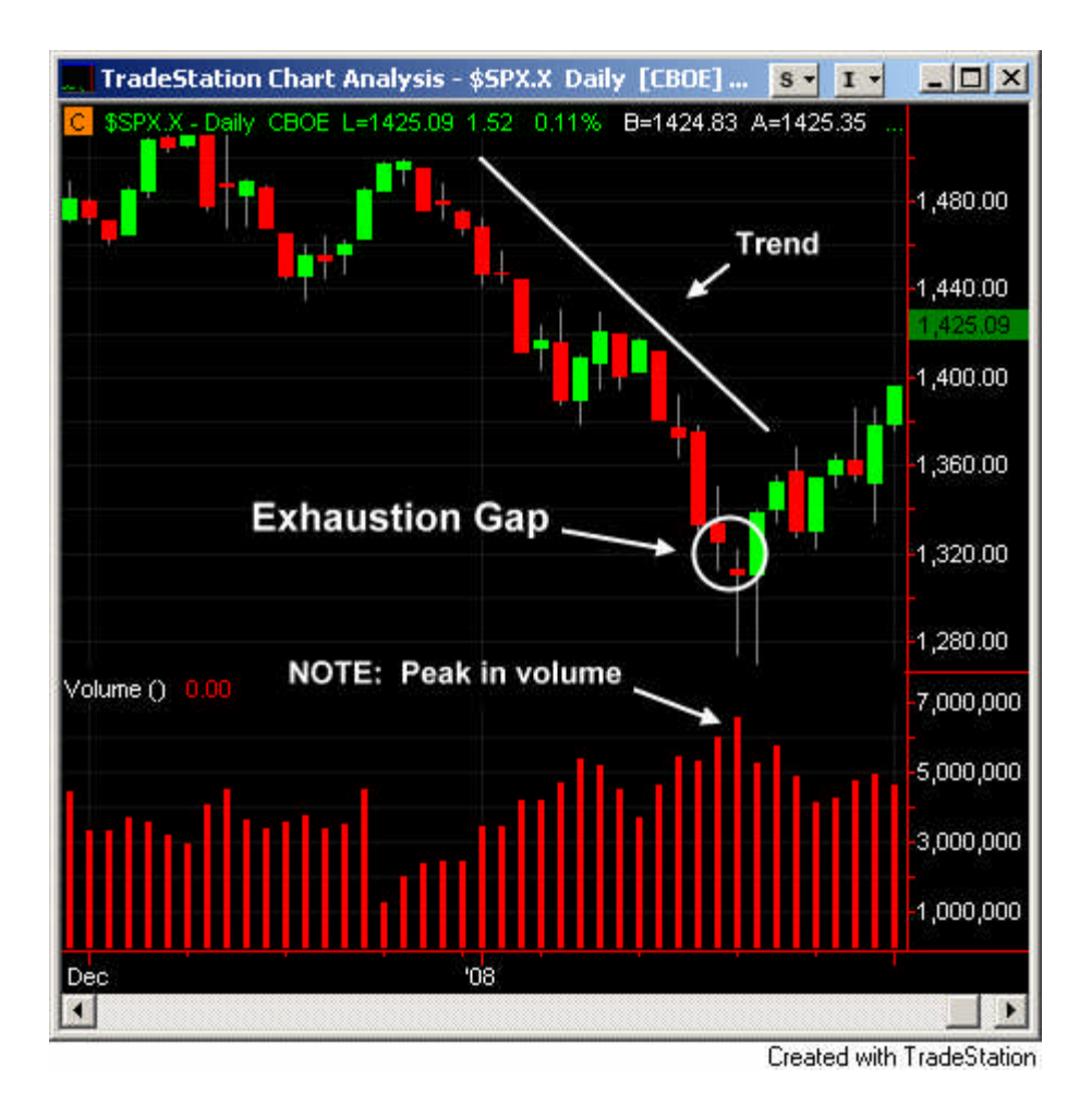
Figure 5. Exhaustion Gap, 1-22-08.

Exhaustion Gaps. These gaps occur at or very near the end of a trend. They are typically associated with very high volume as the very last buyers (or sellers if the asset is in a downtrend) jump aboard a trend that is ending and are overrun by opposing market forces as prices stall and often reverse sharply that day. See Figure 5.