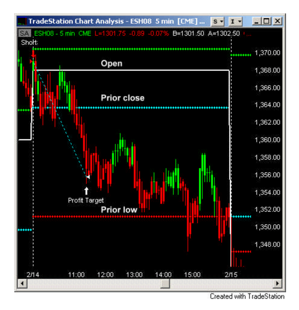
Figure 17. Gap Fade, 2-14-08.

moved my extended target down to capture more profits. This was a good call (I closed out at 1359.25 for +10 points), though a little conservative in retrospect as the selling held steady into the close, filling the prior day's unfilled gap at 1349.75. Total profit for the trade was an average 6.6 points ($330) per contract in little over an hour and half.