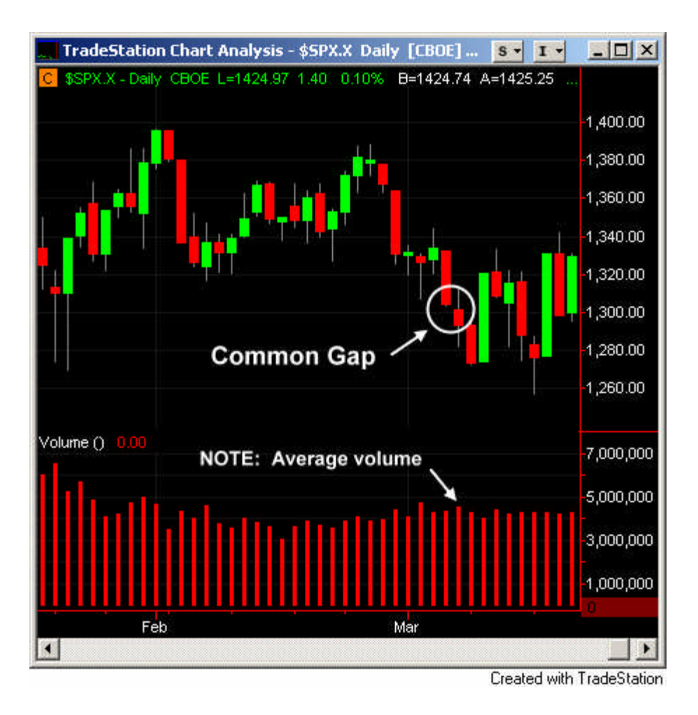
Figure 3. Common Gap, 3-7-08.

Common Gaps. These gaps occur throughout a market's typical ebb and flow in response to a wide variety of events and news. They are often associated with average or below average volume and generally fill the same day. See Figure 3.