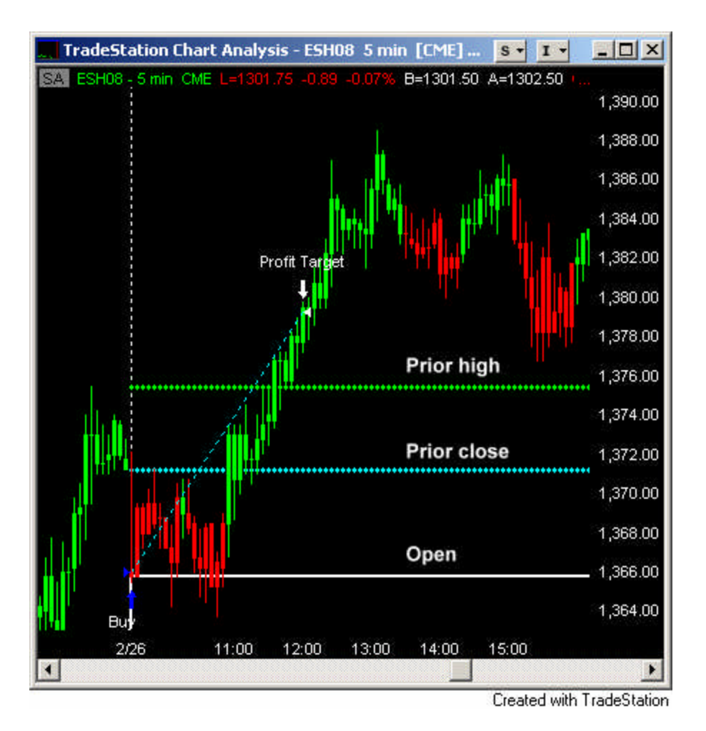
Figure 16. Gap Fade, 2-26-08.

This next gap fade example in Figure 17 also followed an "up" day and shows a 5.25 point gap up (above the prior day close). Seasonality favored a short play and coupled with a somewhat rare, two unfilled "up" gaps in a row this particular week, I was more than ready to fade this gap which opened just below its prior day high price. My nickname for this zone is the "Gotcha" and the post open price action shows why.