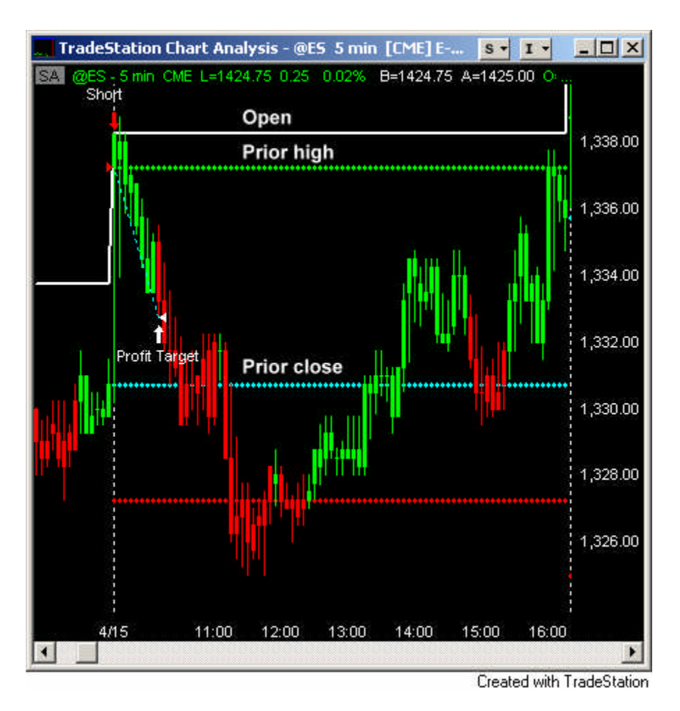
Figure 20. Gap Fade, 4-15-08.

The only concern I had was the fact that we had been selling off quite steadily the prior six days and coming into the middle of the month, we might pick up some new money inflows. But, Otis said "sell" and I knew that history was on his side, so I went short at the open with my target just above gap fill. It was a good call as prices sold off immediately and hit the target in about 40 minutes. I closed 80% at +4 and 20% for +5.5 (just above gap fill) for an average of +4.3 points (+$215) per contract.