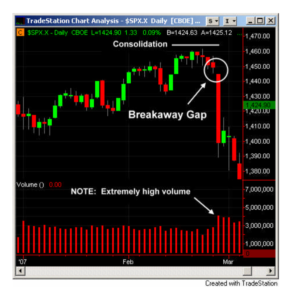
Figure 2: Breakaway Gap, 2-27-07.

Breakaway Gaps. These gaps occur after a period of price consolidation. They are caused by a surge of demand to buy or sell the market, typically in response to a significant event. The gaps are not filled during the same trading day (often not for many days or weeks) and are associated with above average volume. See Figure 2.