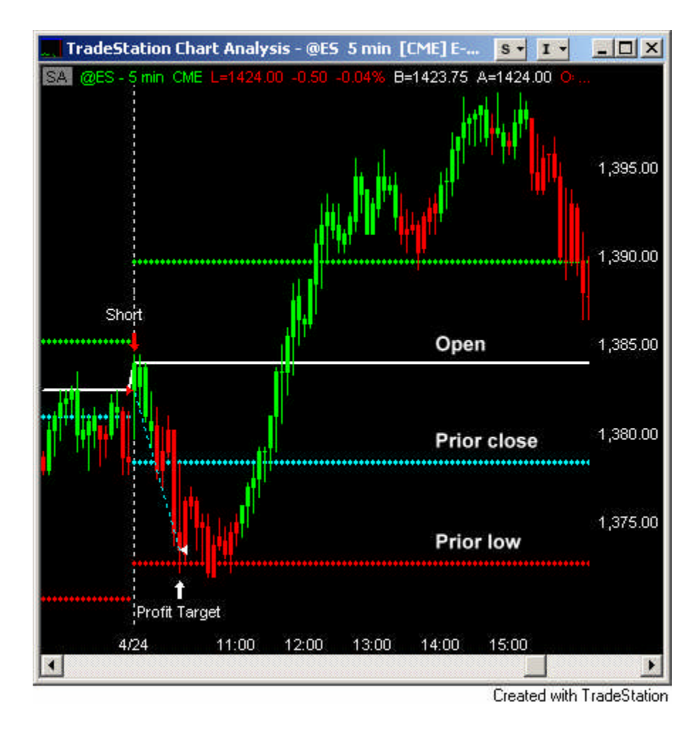
Figure 15. Gap Fade, 4-24-08.

The S&P futures rallied in the morning almost 20 points from the overnight low and were nicely positive by the open (thanks to better than expected jobless claims data). Since I have not identified an edge for incorporating economic news into my decision-making, I simply ignored this positive report and the market's reaction that followed. The 4.25 point gap up met all of my criteria for this tricky zone (i.e. pattern, seasonality, and size) and showed solid profit expectancy historically, so I faded it at the open with an extended target (i.e. below the prior day closing price). After taking a couple points of heat (i.e. prices moved opposite the direction of my trade), the markets stalled and traded down to and though the gap fill. I scaled out for an average of +5.5 points ($275 per contract), closing the last part out for +8.5 points after hitting my target and just before the markets made an extraordinary reversal and moved up almost 30 points.