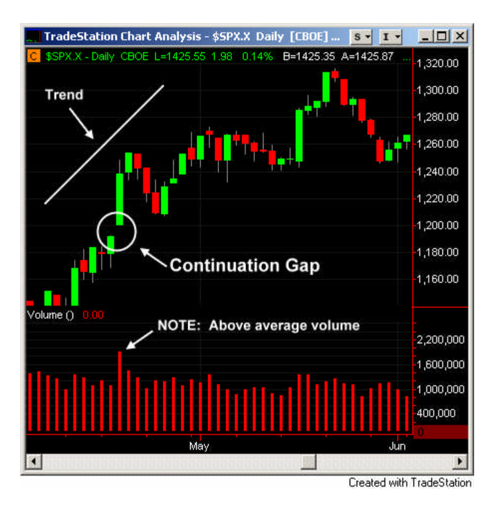
Figure 4. Continuation Gap, 4-18-01.

Continuation / Runaway Gaps. These gaps occur during, and in the direction of, an ongoing trend and are generally viewed as confirmation of a trend's strength. They are associated with above average volume and often do not fill the same day. See Figure 4.