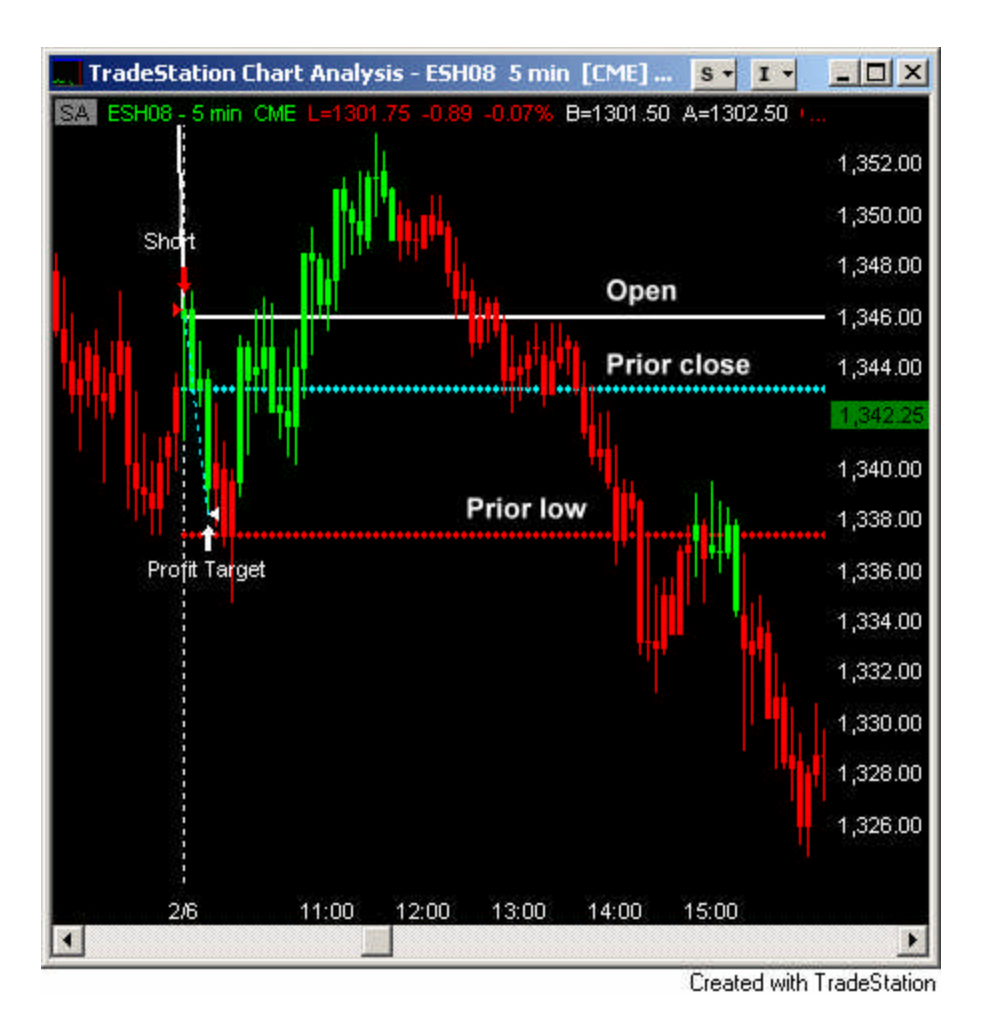
Figure 21. Gap Fade, 2-6-08.

Figure 22 demonstrates a losing gap fade. Though I lost money on this specific trade, there were some positive elements worth noting. This gap was the second one above the high of a prior "down" day in as many days, and again, Otis gave a short signal. Considering this is my rarest of signals, I checked the past 10 years of history, and this has only happened one other time and that resulted in a losing trade. My seasonality research showed that the 16th of the month is the worst performing day historically for fading gaps in the S&P futures (~60% win rate using no stop. The reason is likely due to the fact that the middle of the month is when new money often comes into the market from pensions and other institutions).